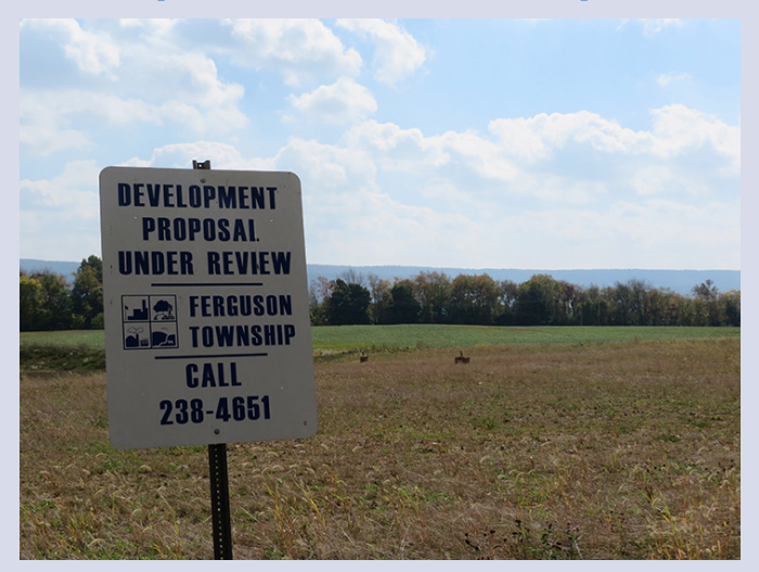
Ferguson Township continues to be an attractive location for development.

Please contact the Department of Planning and Zoning for details.