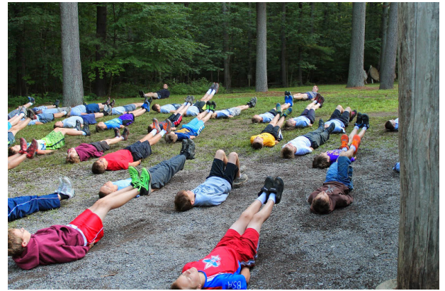
Camp Cadet provides strength training that can help youth overcome their fears.

Although homesickness is a challenge for some of the campers, the bigger challenge may be doing without Internet, cell phones, video games and TV while they’re