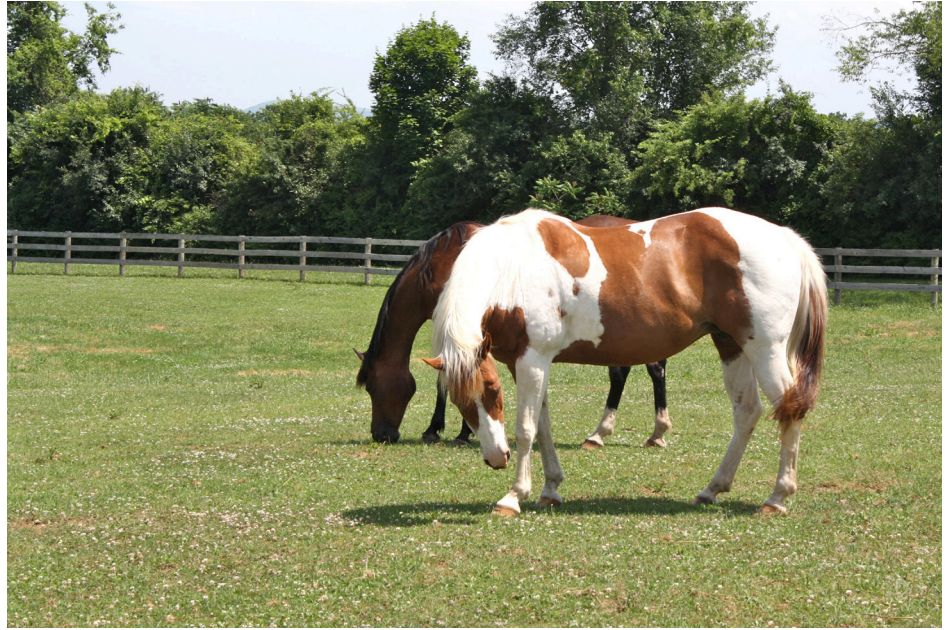
The horse pasture is one of Tudek Park's many exceptional assets, which include its dog park, community gardens, and the Snetsinger Butterfly Garden.

Its covenants stipulated that only 20 of the original acres are to be used for active recreation, no pesticides or herbicides are permitted, and the park would remain sustainable. If the park were ever to revert to another use, ownership would be transferred from the Township to the Clearwater