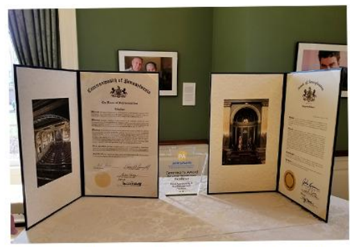
Governor's Awards for Local Government Excellence, Governor's Residence, April 11, 2018 Ferguson Township recognized for Fiscal Accountability and Best Management Practices