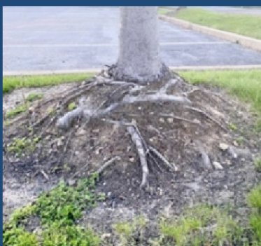
Girdling Roots Below Mulch