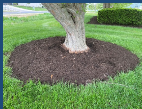
Properly Mulched Tree

There are a number of ways mulch volcanoes can negatively impact trees. When soil is placed around the tree trunk, the tree will grow adventitious or girdling roots around the trunk. As the tree and roots grow, a strangling affect occurs and the tree can suffer a slow demise and affect the stability of the roots and tree. In addition, it causes decay of the inner bark tissue which is responsible for spreading nutrients throughout the tree, including its root system, ultimately impacting the tree's ability to feed itself.