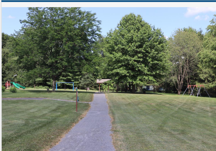
Pictured Above: Meadows Park

COVID-19 Safety Ordinance, Zoning Map Amendments, School Safety & More!