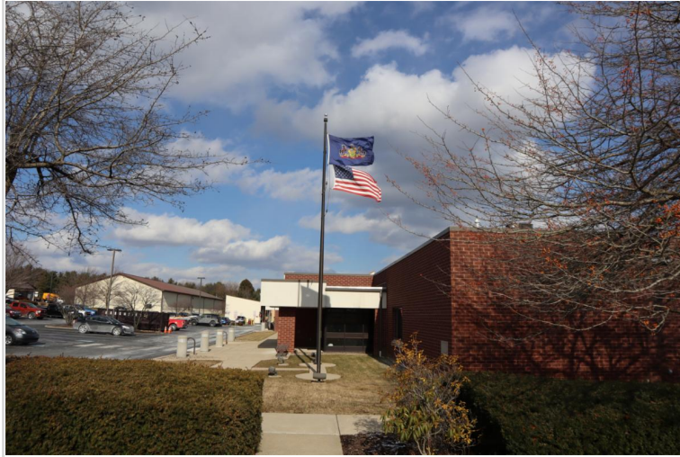
Pictured Above: The Ferguson Township Municipal Building with the US Flag and PA Flag blowing on the breeze on a sunny day in late February.