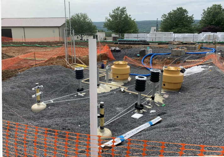
Pictured Above: Construction on the New Public Works Facility