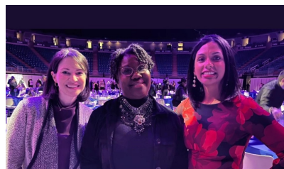
48th Annual Dr. Martin Luther King JR Memorial Banquet - A Testament of Hope

Visit the U.S. Department of Health & Human Services Office on Trafficking in