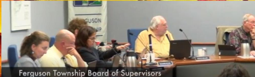
Ferguson Township Board of Supervisors