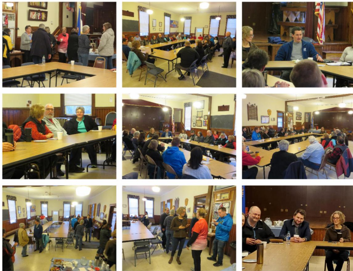
Pictured Above: Collage of pictures from the first Coffee & Conversation at Baileyville Community Hall that took place on Saturday, January 25, 2020.