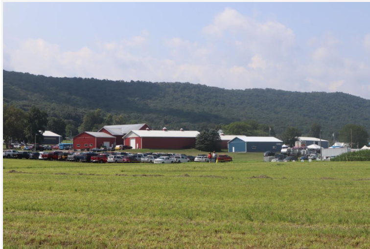
Pictured Above: Ag Progress Days, August 12, 2021. Click the picture above for full photo gallery.