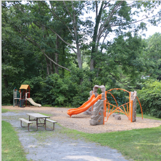
Pictured Above: Park Hills Park