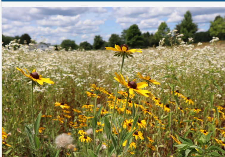
Pictured Above: Flowers in Haymarket Park

Flashing Yellow Arrows, School Real Estate Tax, Ordinance Amendment Public Hearings & More!