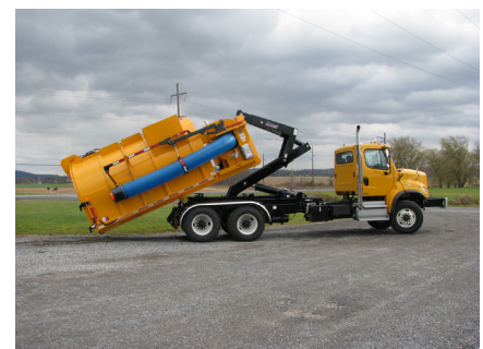
Example of a Hook Truck

Keep an eye out for our brand-new truck coming to a street near you next year!