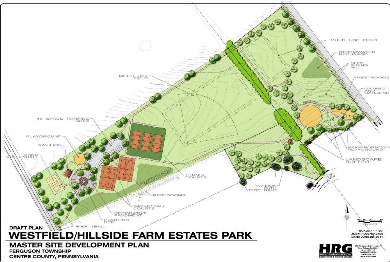
DRAFT PLAN WESTFIELD/HILLSIDE FARM ESTATES PARK MASTER SITE DEVELOPMENT PLAN FERGUSON TOWNSHIP CENTRE COUNTY, PENNSYLVANIA

Prepared For: FERGUSON Pennsylvania Prepared By: ysm YSM GROUP, INC. 1000 W. MARKET STREET, SUITE 200 HARRISBURG, PA 17104