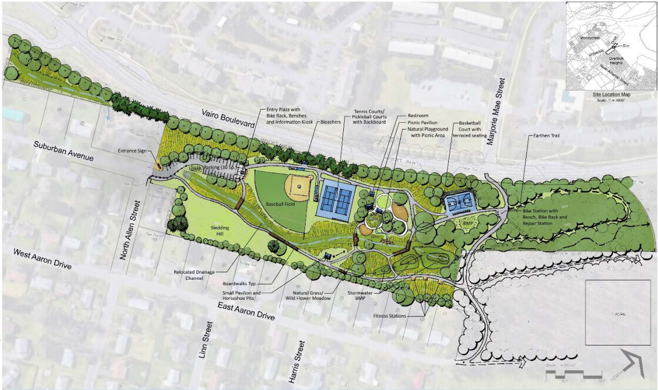
Suburban Park Master Plan Ferguson Township, Centre County, Pennsylvania May 2019

Prepared For: FERGUSON Pennsylvania Prepared By: ysm YSM GROUP, INC. 1000 W. MARKET STREET, SUITE 200 HARRISBURG, PA 17104