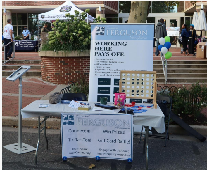
Pictured Above: Ferguson Township's booth at LION Bash on 9/9/2021