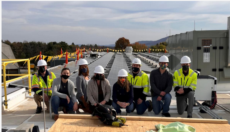
Pictured Above: Ferguson Township Employees viewing the new solar panels on top of the new public works building.