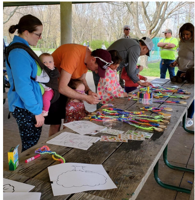
Parents and children engage in arts and crafts activities at the 150th Annual Arbor Day Celebration on April 30, 2022